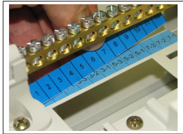
Over label Way labels and neutral bars

10. Place the labels over the existing 3 phase way numbers and markers on left and right side of the internal busbar cover moulding and to the external front shield. These will require cutting to suit the particular size of board.